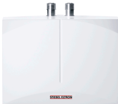
DEM 6 AU

Electronically controlled mini instantaneous water heater for supplying one hand washbasin with maximum efficiency